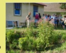
Westchester Rain Garden