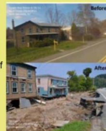
Hurricane Irene Before & After

In addition, we'll discuss what local municipalities can do to promote clean water.